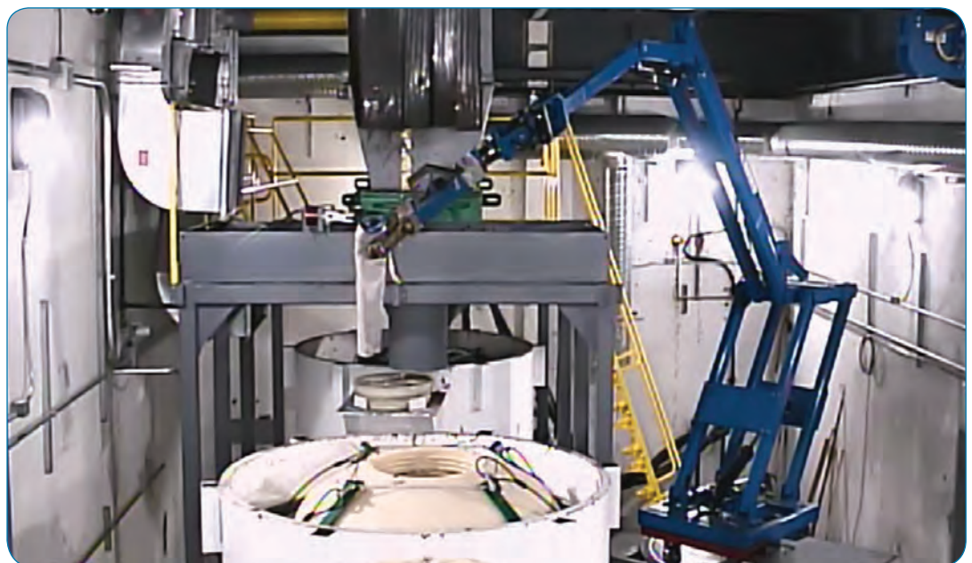
Remote operations for filter removal from container and placement in shredder

www.energysolutions.com/waste-processing/high-activity-filter-processing