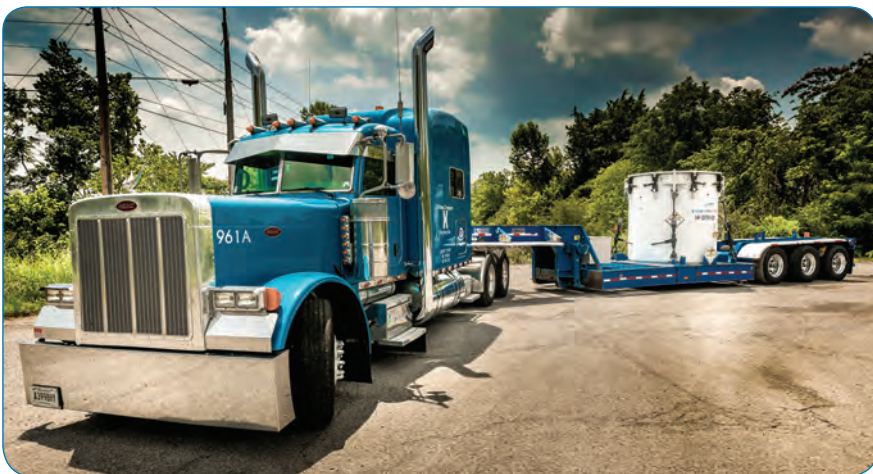
TRANSPORTATION via EnergySolutions' subsidiary Hittman Transport Services