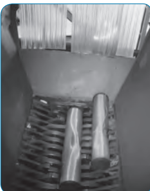
Filters in shredder

WMG's FLTRSTOR™ System™ is made up of filter racks and an integrated open-top container, optimizing the number of filters that can be loaded in each shipment, while reducing worker dose by limiting the number of lifting evolutions required to load the filters. EnergySolutions' robust transportation and cask fleet further streamlines the process.