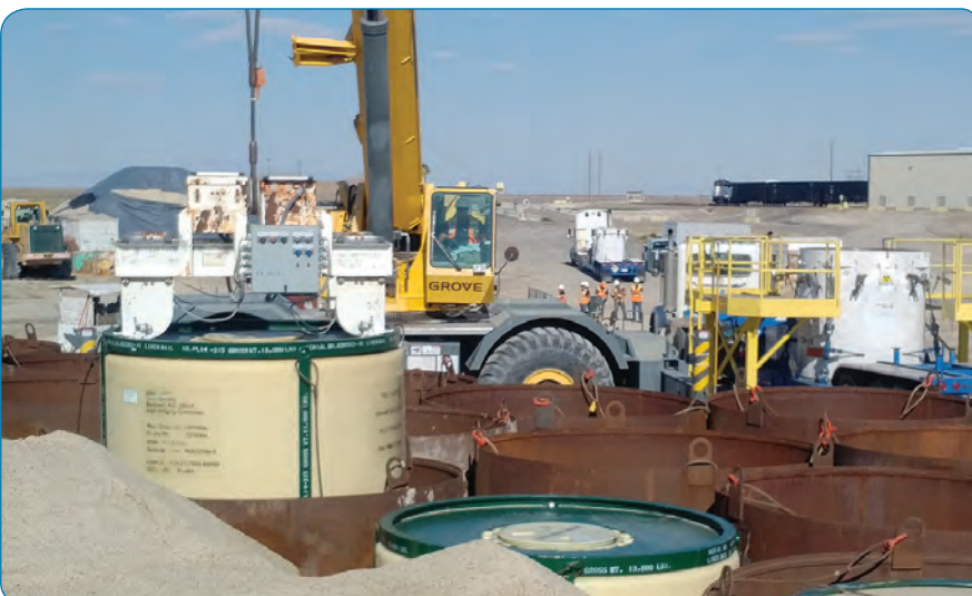
DISPOSAL at EnergySolutions disposal facility in Clive, Utah

Bear Creek Operations provides the safe processing and packaging of radioactive material for permanent disposal. In addition to filter processing, Bear Creek's capabilities include volume reduction through compaction and incineration, resin dewatering, solidification, and evaporation processes.