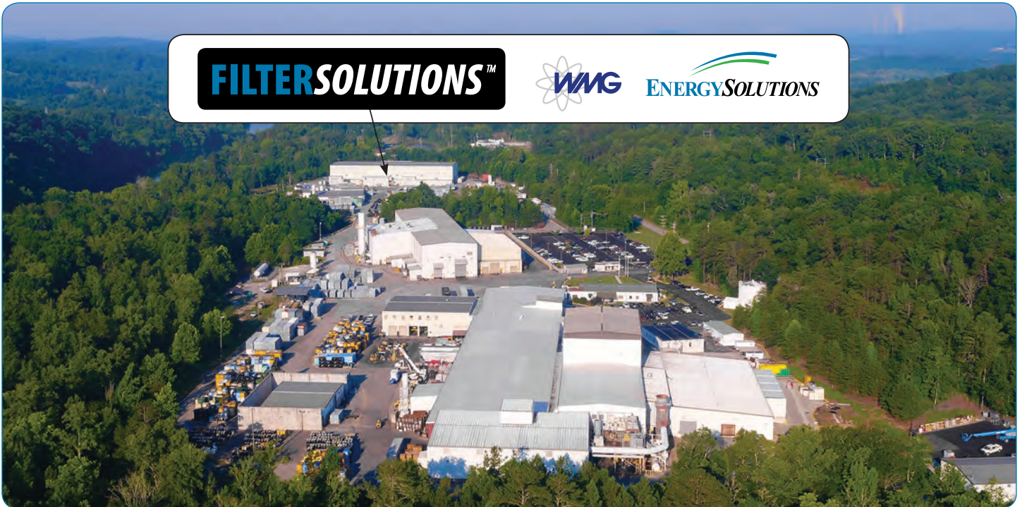
PROCESSING at EnergySolutions' Bear Creek Operations in Tennessee