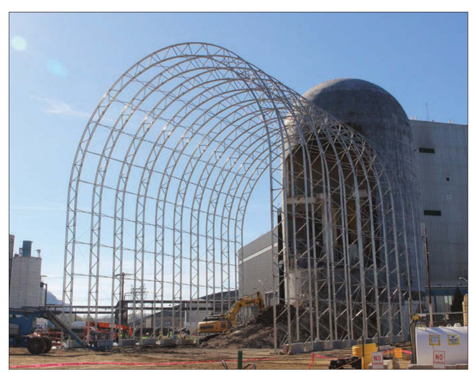
La Crosse: EnergySolutions is decommissioning the boiling water reactor under a license stewardship agreement with Dairyland Power.

I think the funding process is a good process. It is set up so that biennial decommissioning cost estimates [DCE] are done by independent groups, and utilities are required to either set aside or financially support those cost build-ups. There are very few large projects that are funded ahead of time, and you want those funds set aside because nobody can really predict the future.