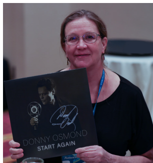
One of the lucky winners

He told stories from his career and how songs came to be, as well as his experience in the entertainment industry. A lucky winner from each table went home with an autographed album.